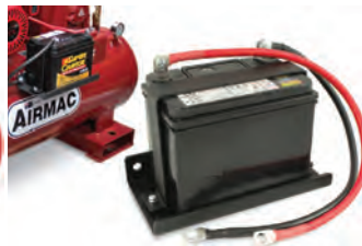
12V Battery Kit SM