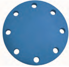
4 inch Blank Flange