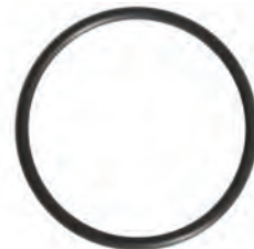
2 inch O-Ring