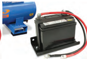
12V Battery Kit SM