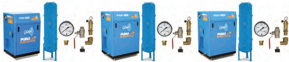
P30S 415V BAS PKG