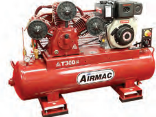
HT20D ES 175psi