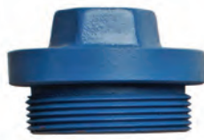
2 inch Plug