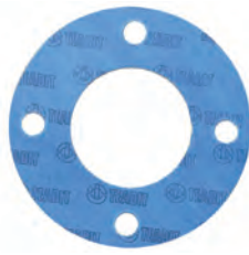
3 inch Gasket