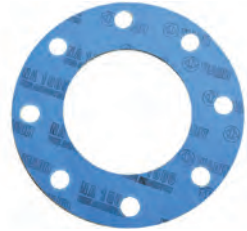
4 inch Gasket