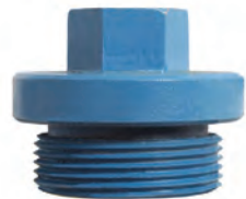
1-1/2 inch Plug