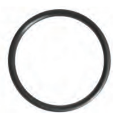
1-1/2 inch O-Ring