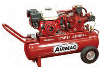
HT20P-H ES 175psi