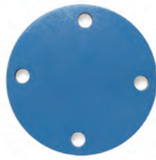
3 inch Blank Flange