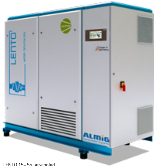
LENTO 15 - 55, air-cooled