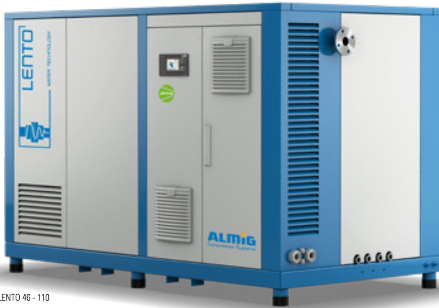
LENTO 46 - 110